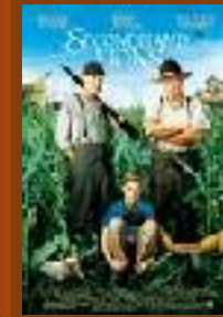
SECONDHAND LIONS 9/26/2003