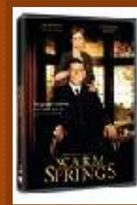
WARM SPRINGS 4/30/2005