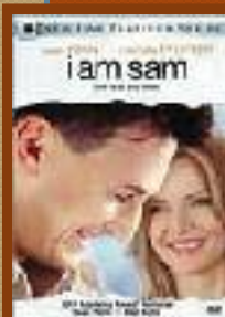
I AM SAM 12/28/2001