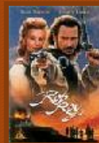
ROB ROY 4/7/1995