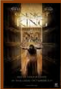
ONE NIGHT WITH THE KING 3/25/2005