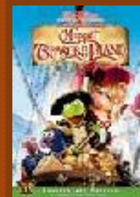
MUPPET TREASURE ISLAND 2/16/1996