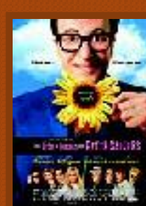
LIFE AND DEATH OF PETER