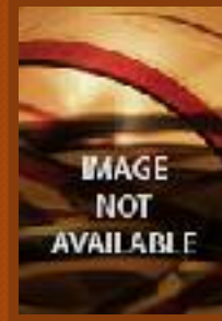
IN JUSTICE 1/1/1900