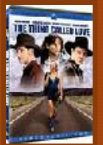
THING CALLED LOVE, THE