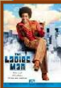
LADIES MAN, THE 10/13/2000