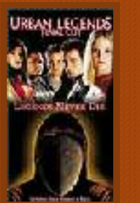
URBAN LEGENDS: FINAL CUT 9/22/2000