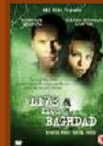
LIVE FROM BAGHDAD 12/7/2002