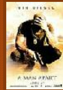
MAN APART, A 4/4/2003