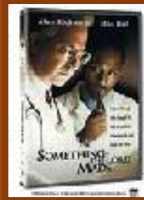
SOMETHING THE LORD MADE 5/30/2004