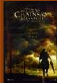
TEXAS CHAINSAW MASSACRE: THE BEGINNING 10/6/2006