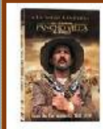
AND STARRING PANCHO VILLA AS HIMSELF 9/7/2003