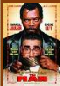
MAN, THE 9/9/2005