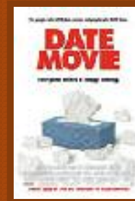
DATE MOVIE 2/17/2006