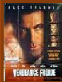
HEAVEN'S PRISONERS 5/17/1996