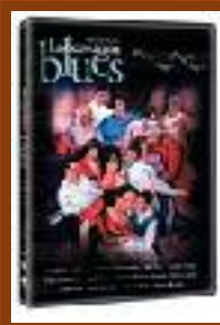
LACKAWANNA BLUES 1/26/2005