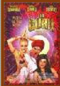
GURU, THE 1/10/2003