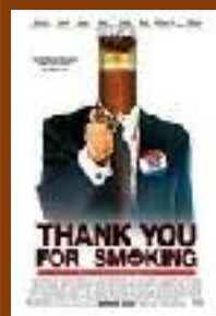
THANK YOU FOR SMOKING 9/9/2005