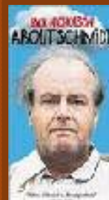
ABOUT SCHMIDT 1/3/2003