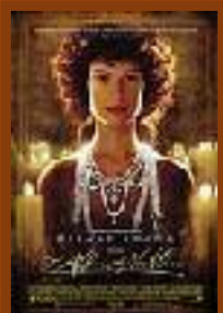
AFFAIR OF THE NECKLACE, THE 11/30/2001