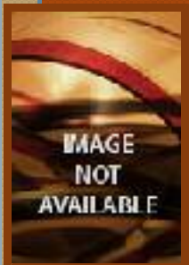
STAR TREK: GENERATIONS 11/18/1994