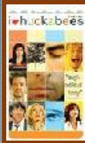
I HEART HUCKABEES 10/1/2004