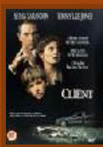
CLIENT, THE 7/20/1994