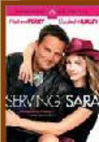
SERVING SARA 8/23/2002