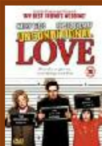
UNCONDITIONAL LOVE 8/23/2002