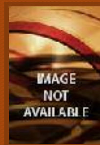
BLOWN AWAY 7/1/1994