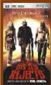
DEVIL'S REJECTS, THE 7/22/2005