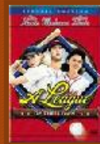
LEAGUE OF THEIR OWN, A