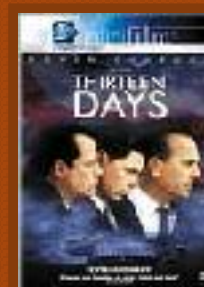
THIRTEEN DAYS 1/12/2001