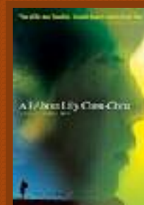
ALL ABOUT LILY CHOU-CHOU 6/6/2002