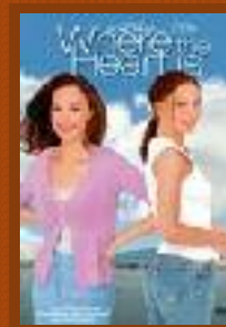
WHERE THE HEART IS 4/28/2000