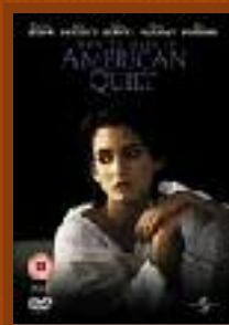
HOW TO MAKE AN AMERICAN QUILT 10/6/1995