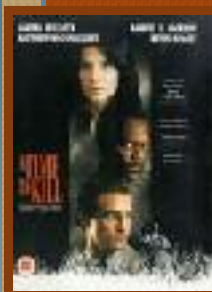
TIME TO KILL, A 7/24/1996